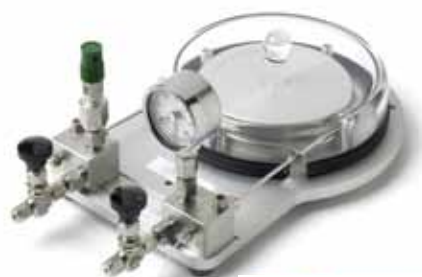
Gastropod - Gas Addition Module Part Number 25620