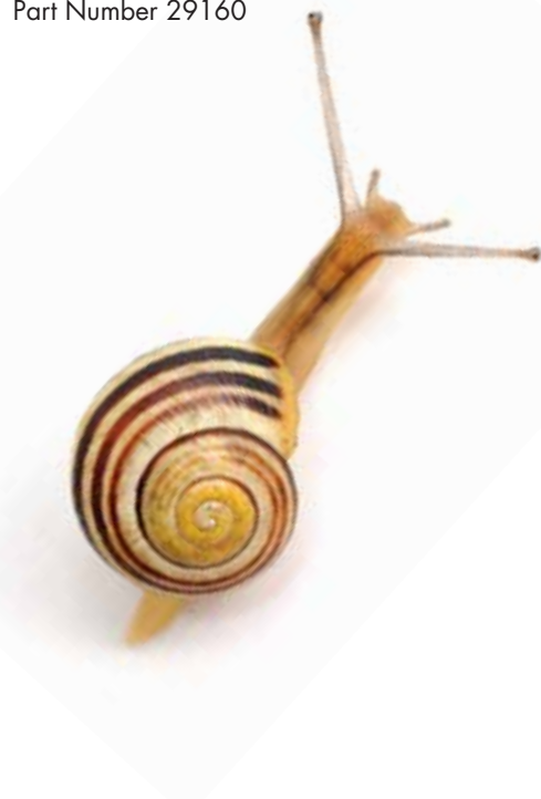
Gastropod - Teflon AF2400 (1m) Part Number 29160