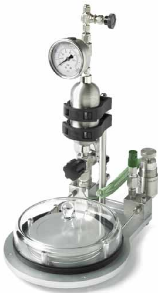
Gastropod - Gas Addition Module Part Number 25620

The Gastropod is suitable for use with many gases and with a wide range of solvents. It is designed to be linked with commonly available flow chemistry devices, allowing it to be used as a reactor in its own right, or as a gas introduction module, depending on your needs