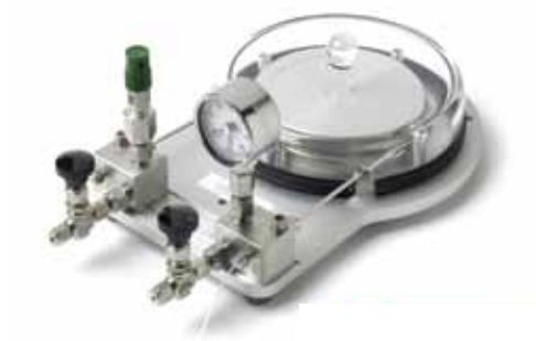
Gastropod - Gas Addition Module Part Number 25620