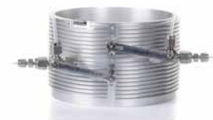
Gastropod - Gas Reaction Module Part Number 46820

The equipment has been used successfully with a number of reactive gases including hydrogen, carbon monoxide, carbon dioxide, oxygen and ozone., as well as with a wide range of solvents such as methanol, THF, dichloromethane and acetonitrile.